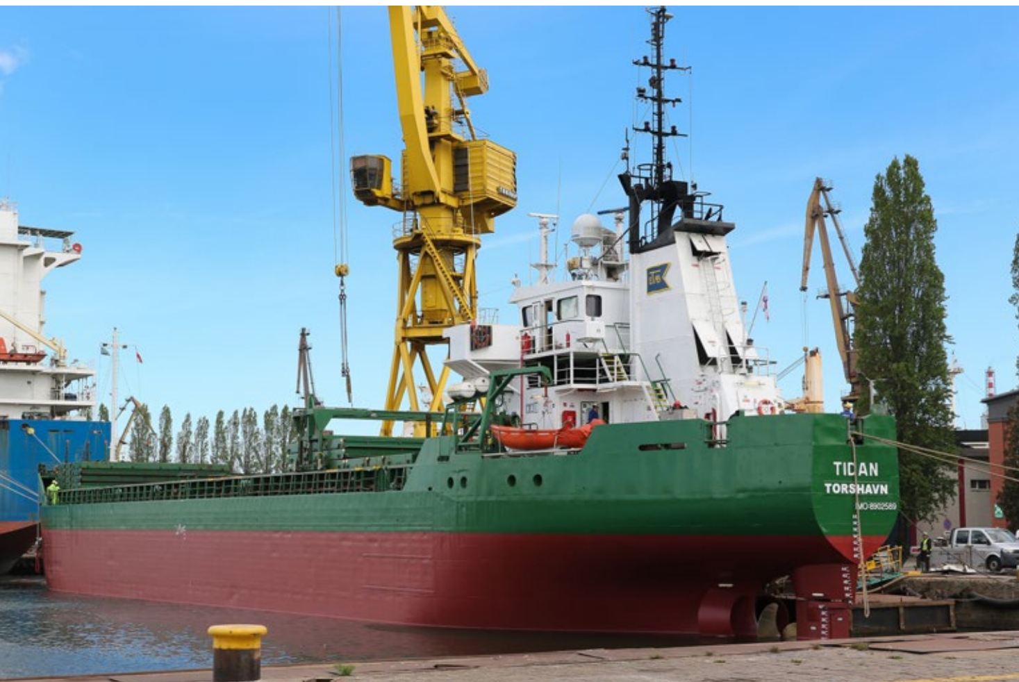
The general cargo vessel Tidan after completion of her repair project at Remontowa

We have equipped Swedish shipowners' vessels with BWT Systems